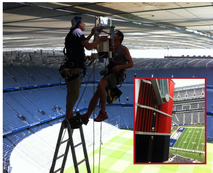
The TRACAB Image Tracking System™ is installed in a sports arena to deliver true three-dimensional tracking of all moving objects on the field in real-time.

With the introduction of the fourth generation TRACAB product ChyronHego is now also gaining recognition in the United States as the tracking technology behind the Player Pointers in the NFL coverage by FOX sports as well as being an integral part of the player tracking solution being rolled out across Major League Baseball stadiums.